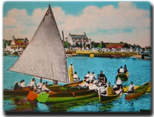
The Portland Regatta, as shown on an historic postcard.