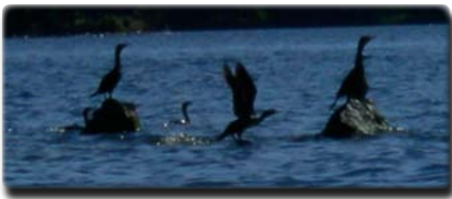
Cormorants on the Shoals off Cow Island.

See http://www.mnr.gov.on.ca/mnr/f_w_files/cormorant2006.html