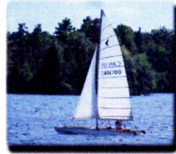
BRLA's President in full sail aboard Grog.

We've had another banner summer on Big Rideau Lake creating new happy memories. The BRLA – as a member driven organization of stakeholders in the social and environmental state of Big Rideau Lake – has as its raison d'être the social network around the Lake, the safety of navigation and boating on the Lake, and the preservation of sustainable, clean water, land and ecosystems in and around the Lake. These objectives reflect our members' values, optimise our individual and collective experiences, and create a framework for sustaining those experiences into the future. However while your lake Association had some great successes year, we also face a real challenge.