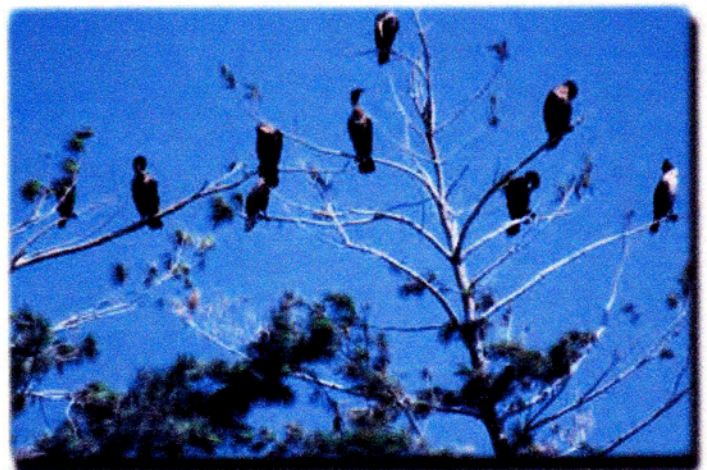
Cormorants on Big Rideau Lake

Problems. The main problem with the bird today is the mess they make (and smell). Due to the high acidic quality of their feces, it kills vegetation on contact. This is what also causes the smell. They will always roost in trees on uninhabited islands, preferring to stay away from humans, noise, etc. In consultation with the Ministry of Natural Resources (MNR), the birds that have been the subject of much consternation in Big Rideau Lake this summer are juveniles (check some of the current photos going around, no nests), and are not here to stay, at least at this point [2]. This situation requires monitoring. Over the years, long time residents have told me of juvenile colonies that would come for a summer and then leave (there was one about 15 years ago in Lower Rideau