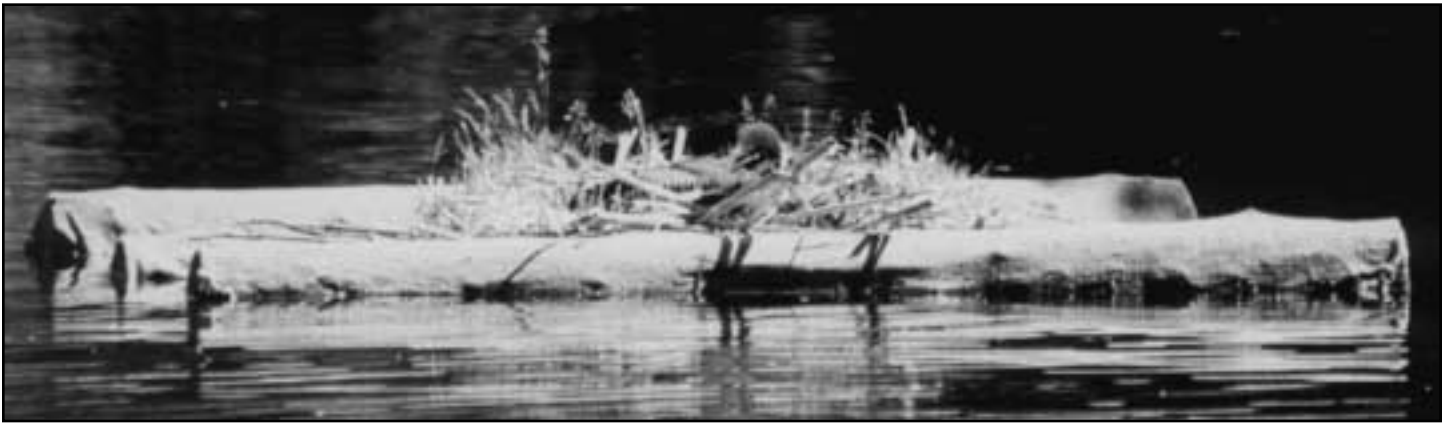
Rideau Lake Platform: "No Vacancy"

chicks, to help us track and protect this symbol of quite lake country living. Participation can range from weekends to 2 to 3 times a week. Anyone interested in becoming a LoonWatcher can sign up at Dry Dock or contact Nelson at 272-5136 or via email at amaral@sustainablewatersheds.ca.