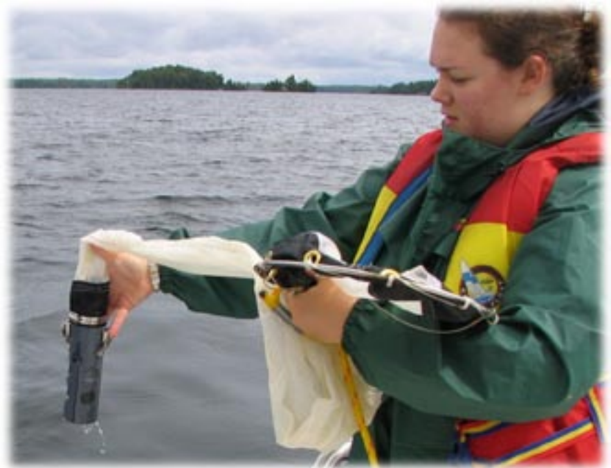
Testing for Spiny Water Flea in Big Rideau Lake. Summer 2004

Mark Saturday, July 23rd at 10:00 am on your calendar. That day, at the Narrows Lock Station, the Big and Upper Rideau Lake Associations are